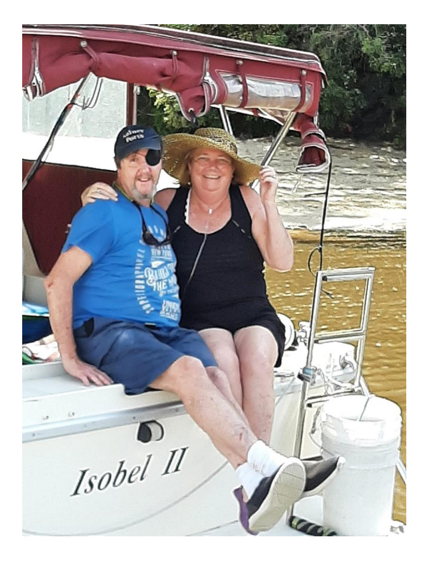
"HAPPINESS, A DAY ON THE WATER"