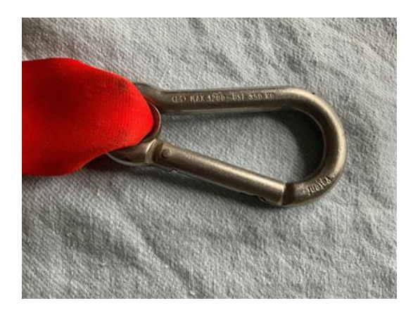
Also accepted under previous SRs but not from July 2023

Wichard Proline – will be accepted (note moulded shape of the snap hook).