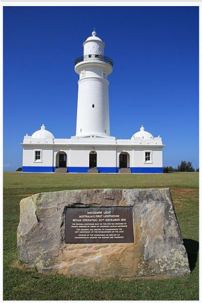
Macquarie Lighthouse, Dunbar Head